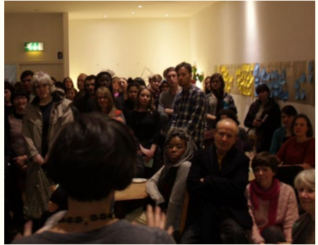
AutiCulture Network & Bakery47 - Creating the Glasgow Loaf / Botanic Concrete Launch