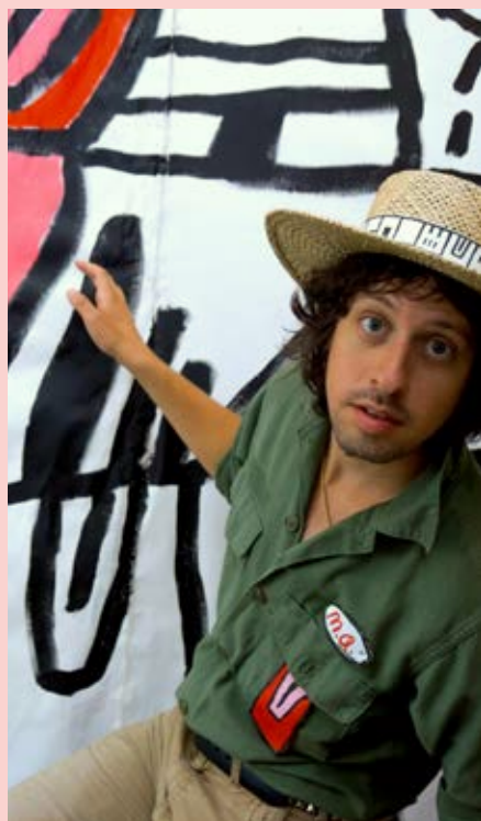
THE SKINNY PICKS

A series of captivating contemporary screen performances, showcasing a selection of vibrant new work from screen actors, editors, directors and writers at the start of their career.