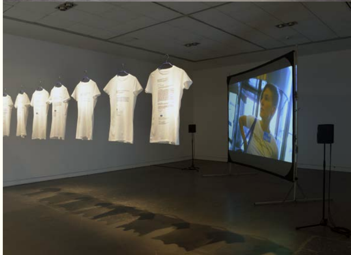
Pilvi Takala exhibition at CCA. Pilvi Takala, Broad Sense (2011).