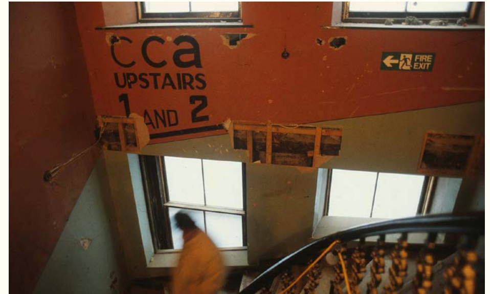
Old entrance to the CCA performance space.